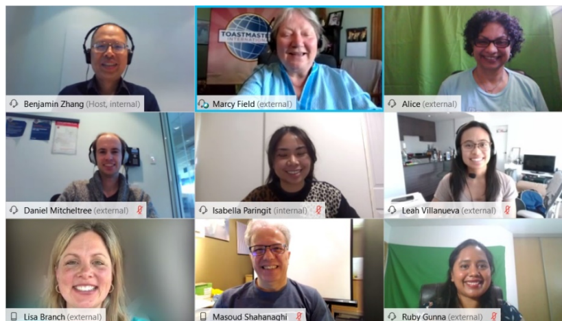
Fluor Communicators online