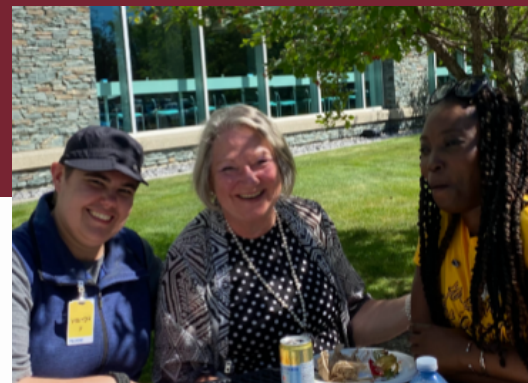
TABLE TOPICS CONTEST